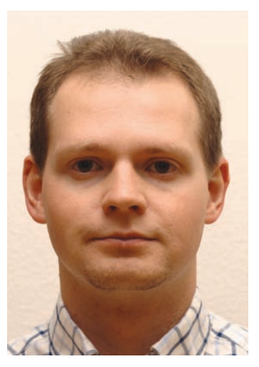
and Platforms Nokia Siemens Networks Finland

Recent advances in mobile communication technologies showed eloquently a tremendous growth in this area. For the time period of less than ten years the industry has evolved from providing users with simple mobile phones used merely for voice calls to the sophisticated smart phones that provide a rich set of multimedia applications and services and open a door to the fast mobile Internet, available for a user at any place any time. Along with it, there has been an immense upsurge of interest from the academy to the